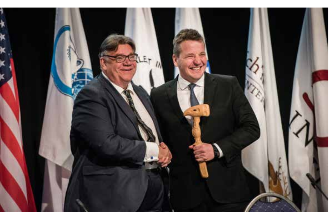
Guðlaugur Þór Þórðarson receives the baton of the Arctic Council, from the Finnish Foreign Minister Timo Soini in Rovaniemi 2019.

One way to secure the position at home is to strengthen available ties with other nations and regions outside the West Nordic region that have demonstrated interest in the developing Arctic. Populous areas with strong links to the Arctic have, in recent years, sought to increase co-operation with the West Nordic nations. These include, for examle, Quebec and Nunavut in Canada, the US states of Alaska and Maine, and Scotland. They all have a very strong position in their home countries and have formed ties through the West Nordic Council and the Arctic Circle.