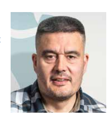
Kim Kielsen, Prime Minister of Greenland (2014 – ) Photo: Government of Greenland/Tusagassiivik

(https://www.highnorthnews.com/en/ greenlands-premier-we-must-worktowards-independence)