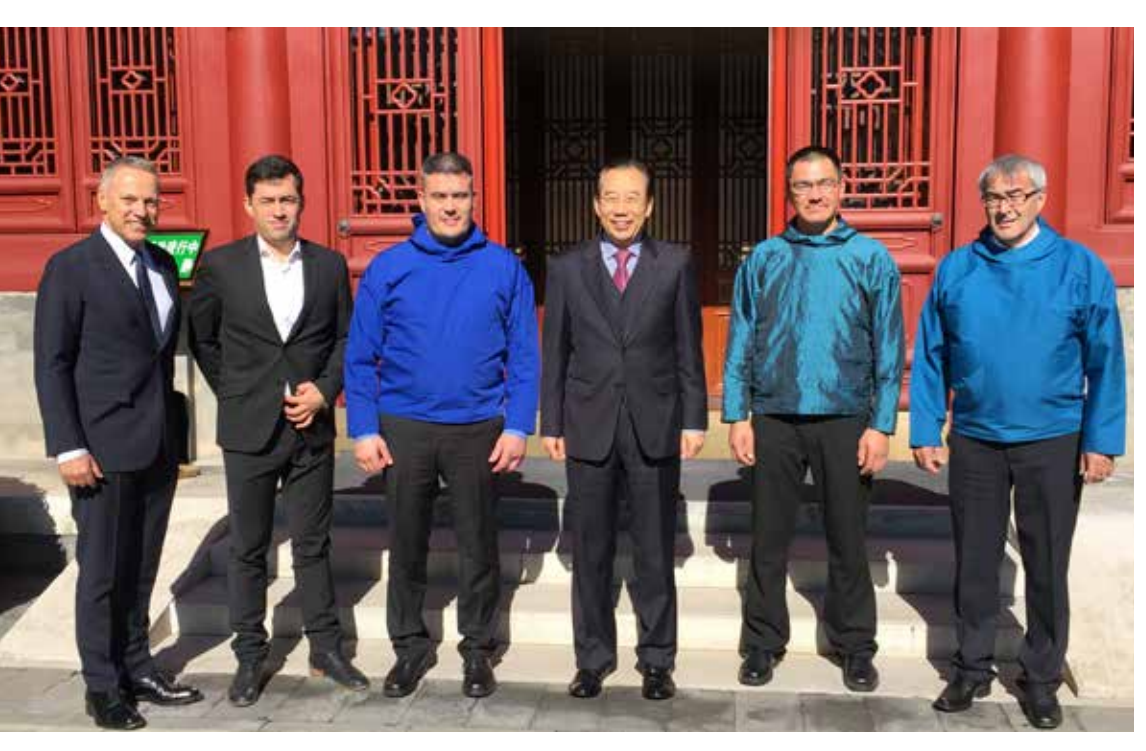
Prime Minister Kim Kielsen and Greenlandic officials with Wu Hailong, representative of the Chinese Foreign Ministry, in their 2017 visit to China.

Meanwhile, Greenland has also developed closer ties to China. Exports to China are thirteen times the amount moved to the United States.<sup>27</sup> China is now Greenland's second most important export market after the EU. When Greenlanders were unsuccessful in raising finance for mining operations in the West, including in the United States, they turned their attention to Asia, both South Korea and China. In the Greenlandic Government's annual reports on foreign affairs, China has been referred to as a preferred partner country since 2015. In the 2016 report, the opening of a diplomatic mission in Beijing was considered, with the explicit intention of linking Greenland's priorities with the Chinese Arctic policy.<sup>28</sup> One year later, Prime Minister Kim Kielsen, along with three other ministers, visited China and introduced the possibility of co-operation in mining operations and infrastructure, including building three international airports. By then, the Greenlanders had been unsuccessful in finding finance in Denmark for building the airports. Following the Prime Minister's visit, major Chinese corporations expressed interest in financing and building them. This was vehemently opposed by the United States authorities, who raised the matter with the Danish Government. Eventually, the Danish Government raised funds for two airports, in Nuuk and Ilulissat, and the Chinese withdrew.